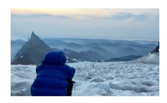
April 15, 2020 A Mystery Of Viral Misinformation (Part I)