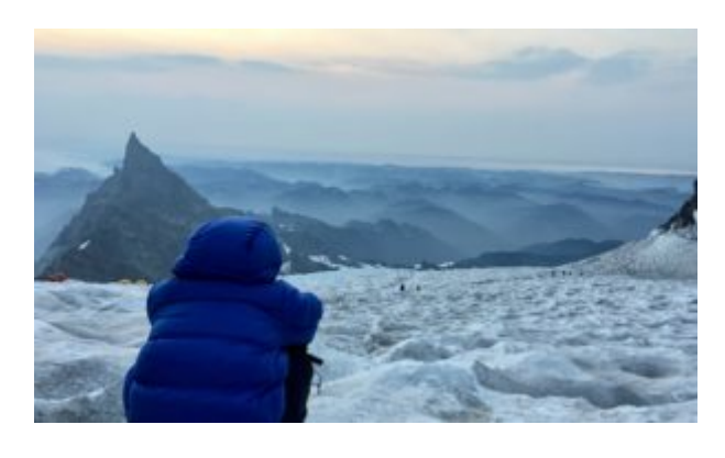
April 15, 2020 The Mystery Of Viral Misinformation 2- Save The Masks