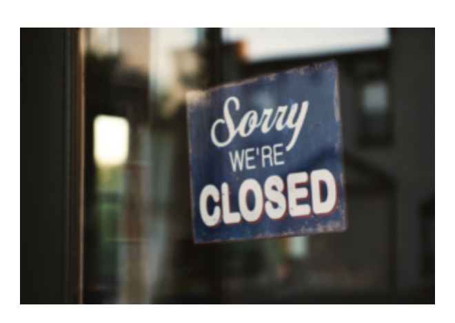
March 16, 2020 Day 15: Should I Close My Business?